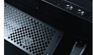
NEC 46" ULTRA NARROW LCD : FAN DETAIL