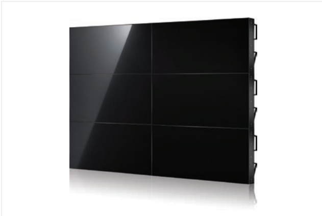
NEC 46" ULTRA NARROW LCD : WALL CONFIGURATION