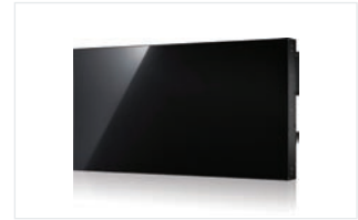
NEC 46" ULTRA NARROW LCD : ANGLE