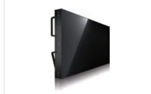
NEC 46" ULTRA NARROW LCD : FRAME DETAIL